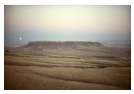
Square Butte. Watch for it if you're traveling north on Highway 15 to the Montana Traffic Education Conference in Great Falls.

This and other Montana geologic attractions are featured on the MDT Geologic Roadsigns web page; <a href="http://www.mdt.mt.gov/travinfo/geomarkers.shtml">http://www.mdt.mt.gov/travinfo/geomarkers.shtml</a>