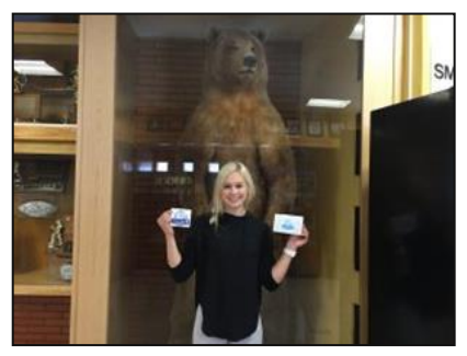
Billings West student with It Can Wait pledge cards.

to rotate through the simulator. The students were excited to try out the virtual reality (VR) technology used to simulate the dangers of texting and driving.